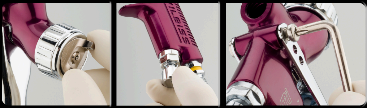
TS1 Trans-Tech Air Cap