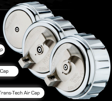
RS1 Round Spray Air Cap

Three choices of compliant air cap and four fluid tip sizes cater for the varying viscosities of every professional automotive refinish material, ensuring perfect results every time.