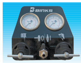
Easy to use controls